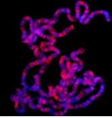
Molecular Bases of Cell Structure & Function