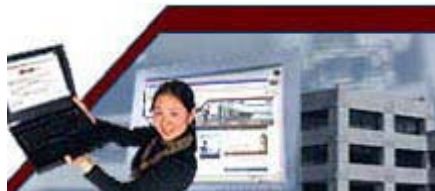
Figure 2. Example web graphic

Or graphically as seen in Figure 2 it is certain that my hypothesis is true.